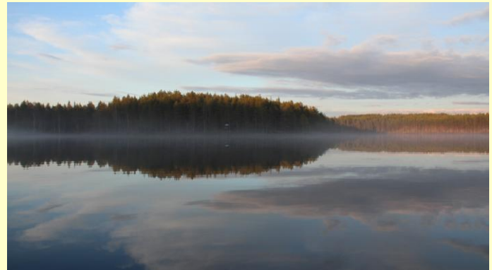
View from the camp

Any further information might be provided by Laetitia Becker if you ask for it.